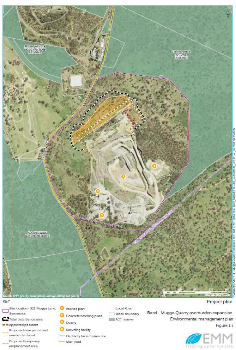
Figure 1 - Site location and immediate surrounds

The new bund and emplacement area is located to the north and east of the approved quarry pit extent between Mugga Lane and Callum Brae Nature Reserve, within the approved extractive industry lease area of 106.4 hectares (ha). Figure 2 shows the extent of the project in relation to the proposed expansion activities.