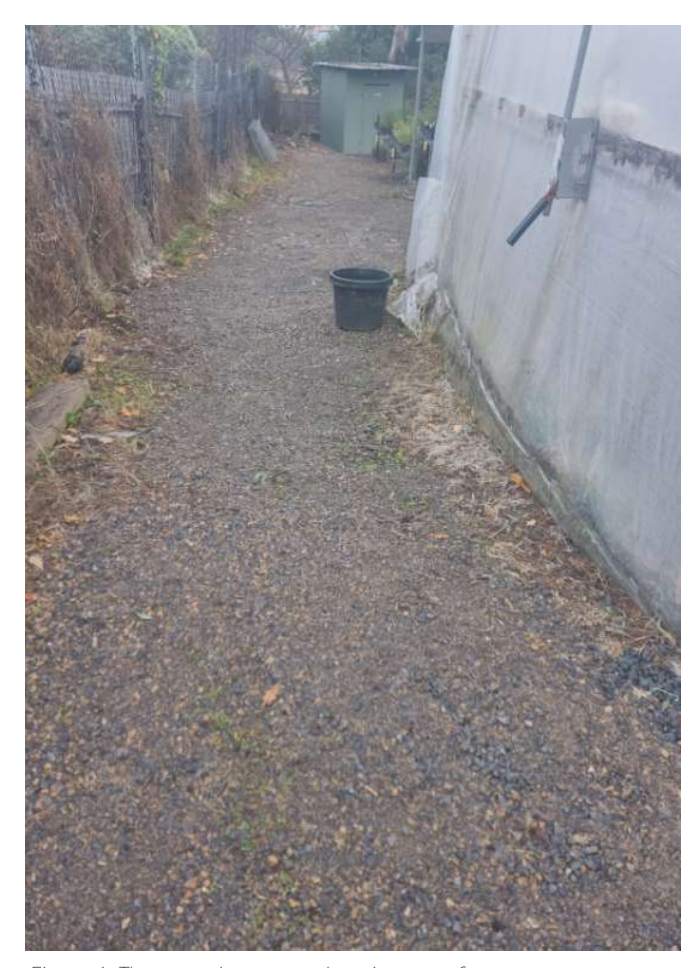
Figure 6: The most dangerous slope is now safe to use