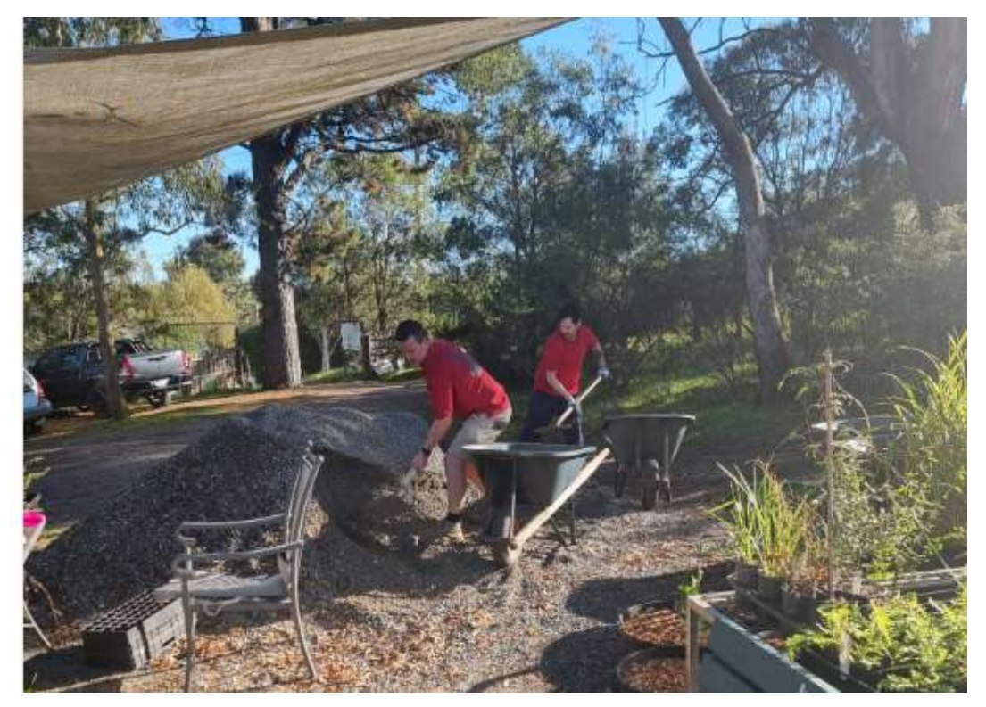
Figure 1: Bunnings Croydon crew helping move the crushed rock