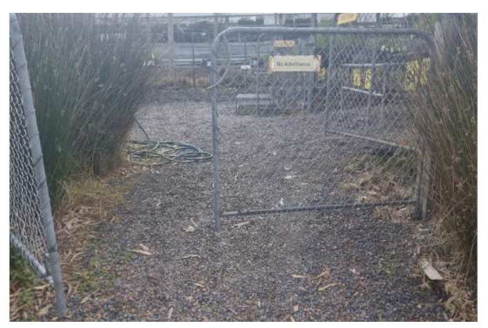
Figure 7: Entry to the hard standing area

LetterOfThanksCCNI20240612 Melway ref: 37 H12