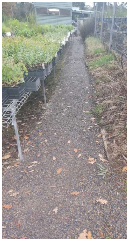
Figure 5: The muddiest pathway is now safe to use