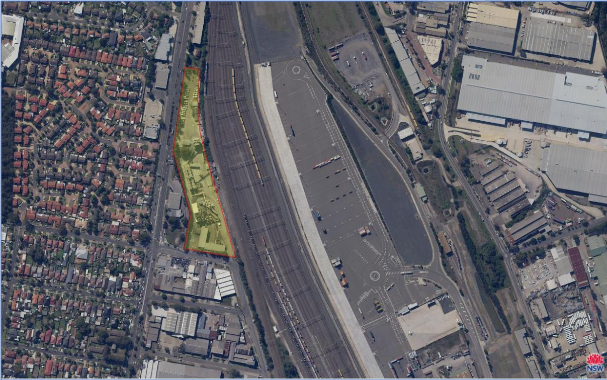
Figure 1: Enfield Asphalt Location Map