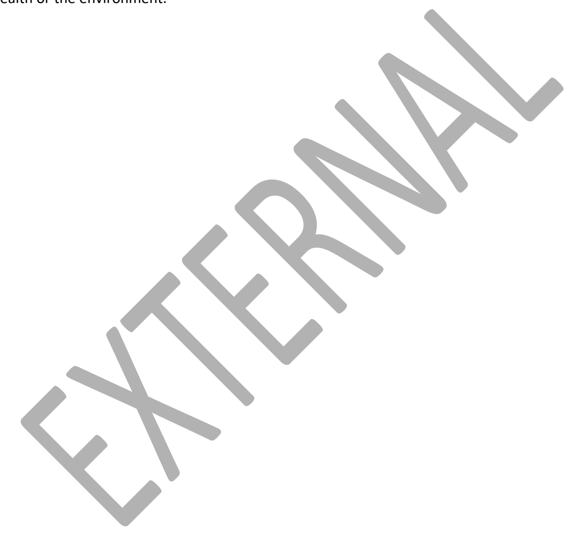
Table 3 below is an inventory of potential pollutants kept on the premises. This inventory provides a description of the main hazards to human health or the environment, an assessment of the likelihood of the hazards occurring and also includes the current controls and safety equipment and/ or pre-emptive actions in place to minimise or prevent risk of harm to human health or the environment.