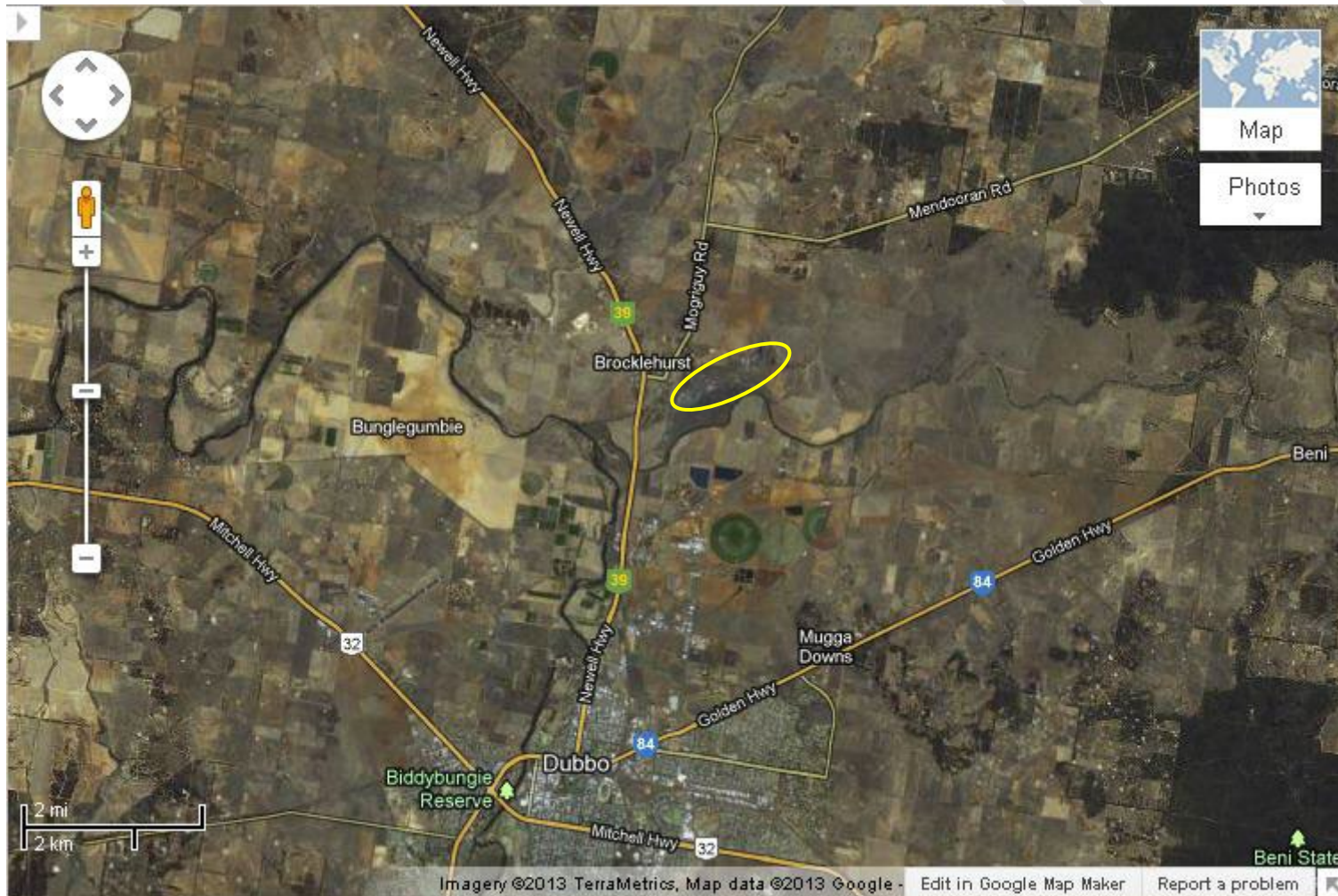
Figure 1 - Talbragar Quarry Location Map